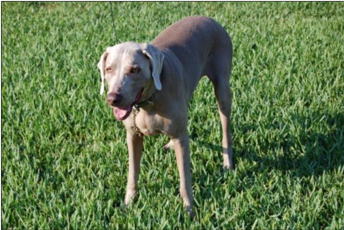
"Buddy says I'm Registered"

The Broadwater Pet Registry is a tool that can help you locate your lost pet as well as helping a stray find its way home. If you ever lose or find a pet, your first call should be to your Block Captain. All Block Captains have a list of registered pets for the entire neighborhood. You may have included your pet's information on your member form but to be sure we have up to date information you want to register online. You can register your pet at www.broadwaterfl.org by clicking on the "Contact Us" tab then "Pet Registry".