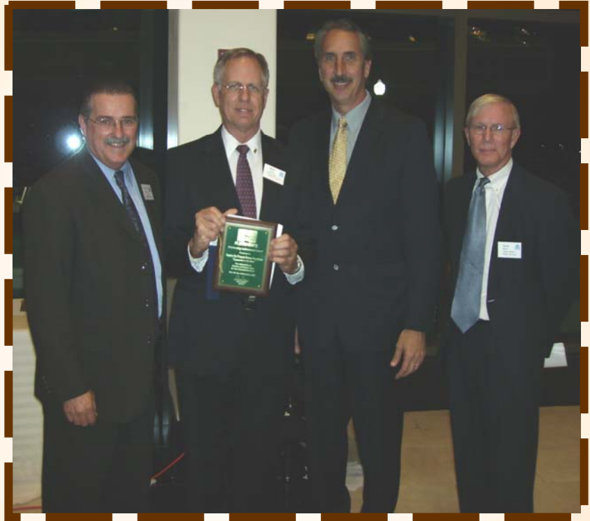
Coquina Key Community on the Move