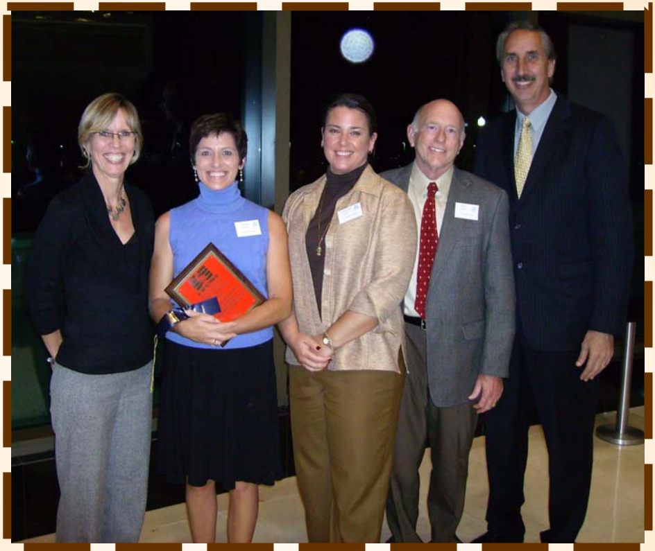
Crescent Lake Restoration & Beautification